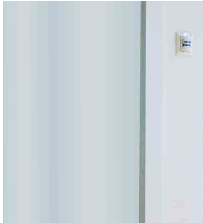
RD 50® – SCHOTT Radiation Shielding Glass